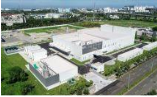
Bird's-eye view of Taiwan Tohcello